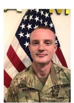
CDT Wagner: Adjutant General