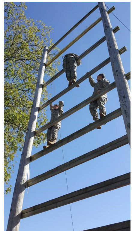
Cadets tackle an obstacle at the Fall

We would love to see as many of our alumni as possible at this years Military Ball. Please join us if you can to show the next generation of leaders how important these military traditions are.