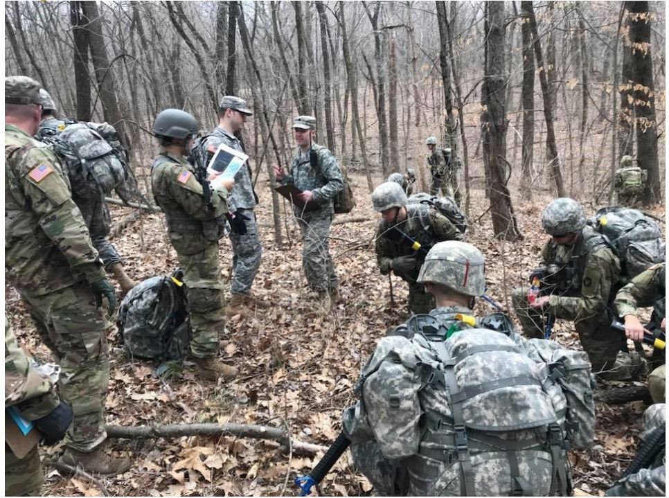
Superlab 22 APR at McBride